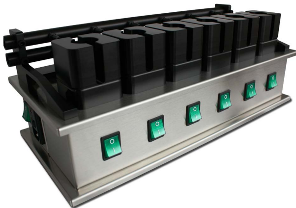
Figure 1 - A 6-station V6-CB magnetic stirrer