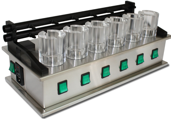
Figure 1 - A 6-station V6-CA magnetic stirrer