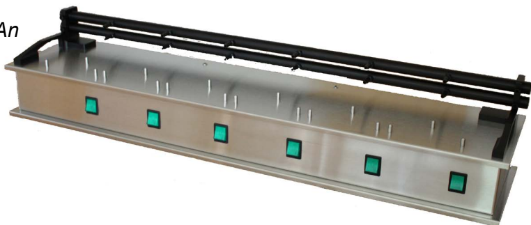
Figure 1 - An H6 station magnetic stirrer

PermeGear's Side-Bi-Side Cell Manual Diffusion Systems include one or more Side-Bi-Side Cells, an H-Series Stirrer and a heater/circulator. Each half cell is surrounded by a "jacket" through which heated water is circulated. Cell Clamps securely locate the Side-Bi-Side Cells directly above individual magnets. H-Series Stirrers provide easy access for connecting the jackets to a heater/circulator (not shown in the photo below). PermeGear provides heater/circulators, but often these are already available in users' labs.