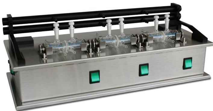
Figure 1 - An H3 magnetic stirrer

PermeGear's Side-Bi-Side Cell Manual Diffusion Systems include one or more Side-Bi-Side Cells, an H-Series Stirrer and a heater/circulator. Each half cell is surrounded by a "jacket" through which heated water is circulated. Cell Clamps securely locate the Side-Bi-Side Cells directly above individual magnets. H-Series Stirrers provide easy access for connecting the jackets to a heater/circulator (not shown in the photo below). PermeGear provides heater/circulators, but often these are already available in users' labs.