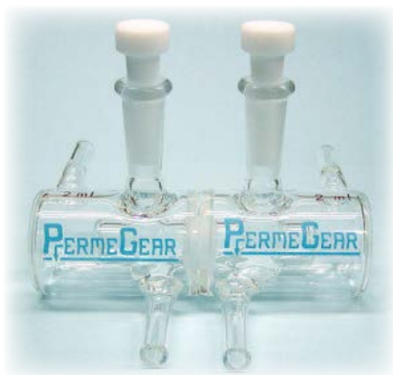
Figure 3, a Side-Bi-Side Cell

Prior to using the cells, clean the stirbars and stoppers by rinsing them with methanol (MeOH) first and then deionized water several times. Let them dry. Fill both chambers with methanol. Then use a disposable plastic pipette to suck and release methanol from the chamber several times to clean both chambers as well as the contact surfaces of the chambers and the sampling ports. Replace methanol with deionized water. Repeat the previous cleaning step. Finally dry the chambers of each cell in the air before use. Repeat the cleaning procedures after use.