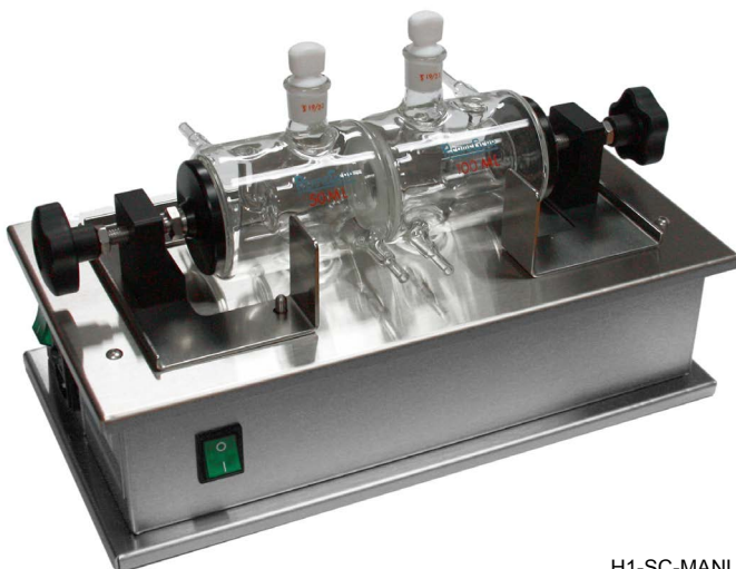
Figure 1 - An H1-SC magnetic stirrer, Side-Bi-Side Cell, and Cell Clamp

PermeGear's H1-SC Side-Bi-Side Cell Manual Diffusion System includes one Side-Bi-Side Cell, an H1-SC Stirrer, and a heater/circulator. Each cell half is surrounded by a "jacket" through which heated water is circulated. A cell clamp securely locates the Side-Bi-Side Cell directly above individual stirrers. H1-SC Stirrers provide easy access for connecting the jackets to a heater/circulator (not shown in the photo below). PermeGear provides heater/circulators, but often these are already available in the users' labs.