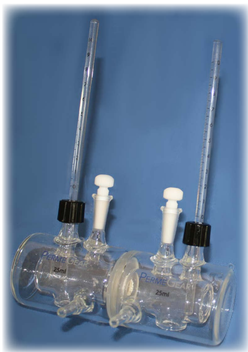
Figure 3, Side-Bi-Side Cell

Prior to using the cell, clean the stirbars and stoppers shown by rinsing them with methanol (MeOH) first and then deionized water several times. Let them dry. Fill both chambers with methanol. Then use a disposable plastic pipette to suck and release methanol from the chamber several times to clean both chambers as well as the contact surfaces of the chambers and the sampling ports. Replace methanol with deionized water. Repeat the previous cleaning step. Finally dry the chambers of each cell in the air before use. Repeat the cleaning procedures after use.