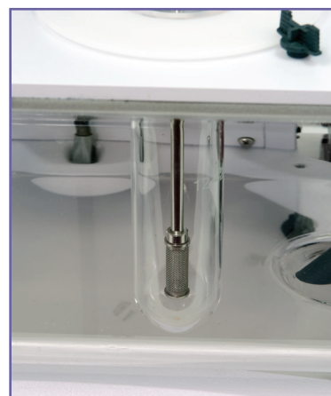
Model 2500 with Small Volume Basket