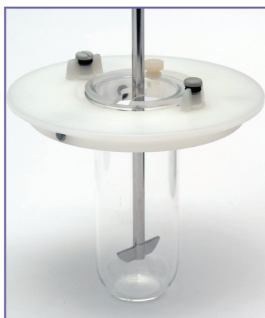
Small Volume Conversion Kit