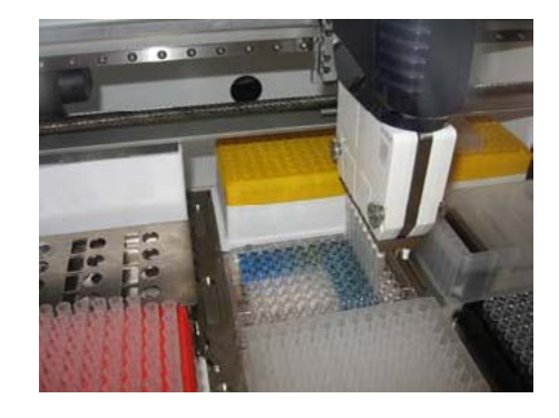
Figure 1 PIPETMAX 268 Performing the Bradford Assay.

The Bradford Assay performed in this application was automated using the PIPETMAX 268 bench top pipetting system (Figure 1). Absorbance of the Coomassie dye bound to albumin protein was measured with the Vmax® Kinetic Microplate Reader. Results were compared with manual method performance using a combination of the PIPETMAN® L Single Channel and PIPETMAN® M Multichannel pipettes.