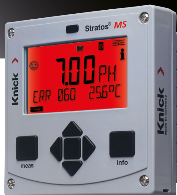
Red flashing display: Alarm, error