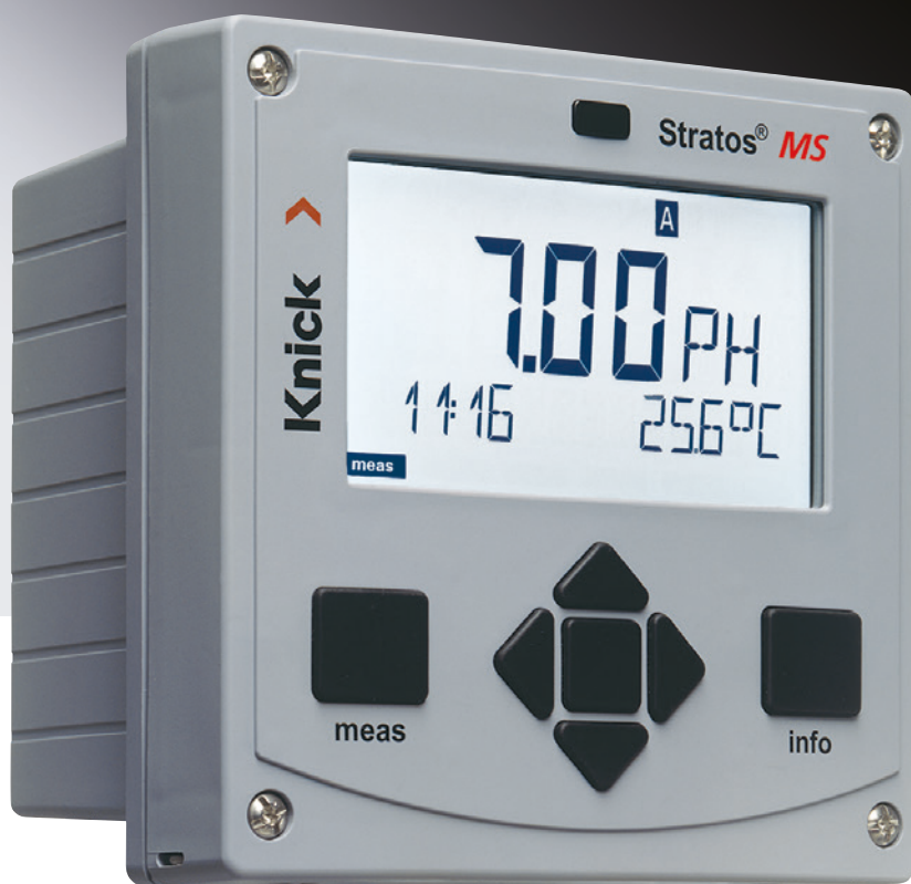
White display: Measuring mode