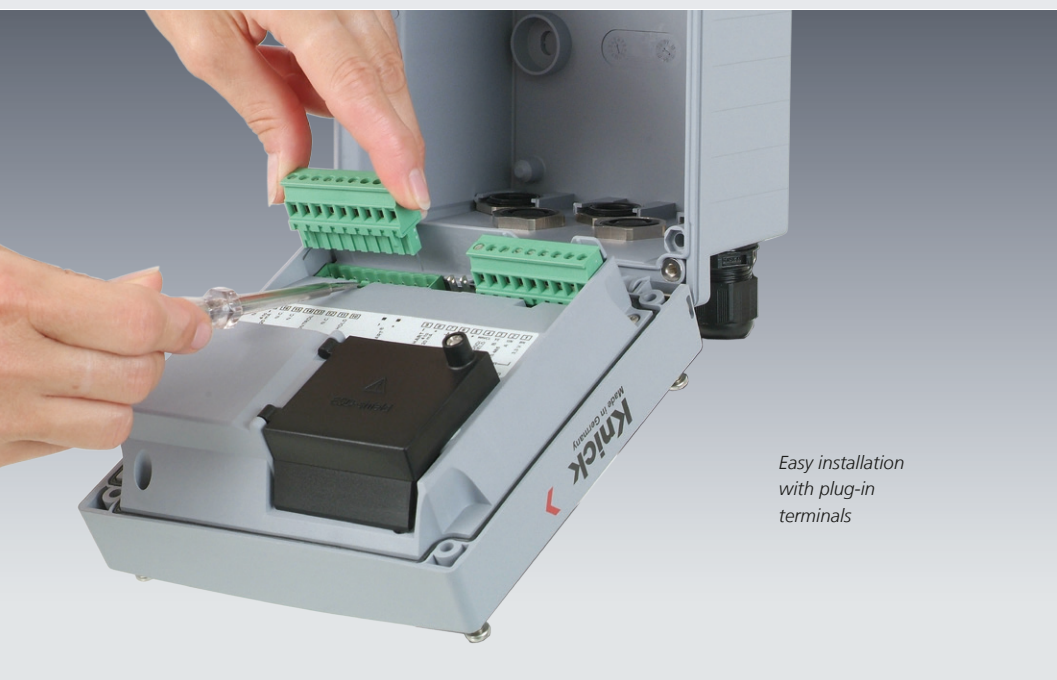
Easy installation with plug-in terminals

Stratos Pro is suitable for wall, pipe or panel mounting. The rear unit can be pre-assembled; all parts are easily accessible thanks to the large terminal compartment.